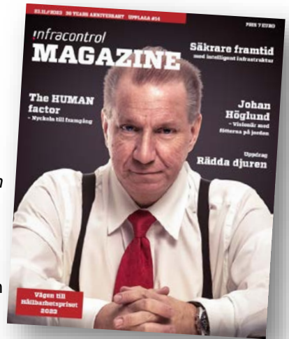
Team spirit helps us keep on going strong. Order your own copy of Infracontrol Magazine 2023 on our website.

"People get stronger, smarter and much nicer when they work together as a team. But above all, things are so much more enjoyable. We want people to enjoy their jobs. Every day!"