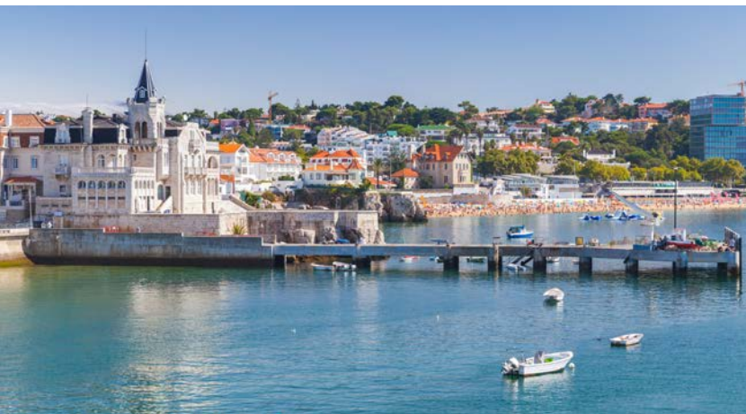
Cascais municipality, about 20 miles west of Lisbon, is one of Infracontrol's customers.